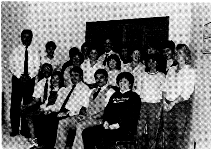
Pictured above are the smiling faces of the Accounts Payable group located at Data General-Manchester.