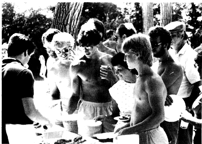
Employees enjoy a Caribbean-style buffet.

After lunch was a time for some to snooze on the beach and for others to work off the meal with more volleyball or frisbee. Others chose to walk along the shore line to enjoy the beautiful scenery and review the sand castle construction efforts undertaken by many of the children throughout the day.