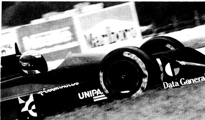
Data General/Team Tyrrell visits Detroit this weekend.

Data General and Team Tyrrell are once again combining computer technology and Formula 1 racing as the team visits North America for a pair of Grand Prix races this month. Last Sunday, driver Jonathan Palmer guided his car to a sixth place finish in Montreal. In two of his last three races, Jonathan's finishes were good enough to earn him points towards the world Grand Prix championships. The team travels to Detroit for that city's Grand Prix to be held on Sunday. Data General has been a sponsor and working partner with the Tyrrell Racing Organization since 1986.