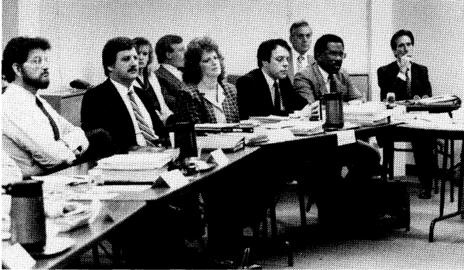
Employees take part in the recent Advanced Management Course, offered by Corporate Management and Organizational Development.

M.O.D. continues to expand its course offerings available to managers. For more information on these seminars or any M.O.D. course, contact Corporate M.O.D. at extension 6958 in Westboro or your divisional M.O.D. representative.