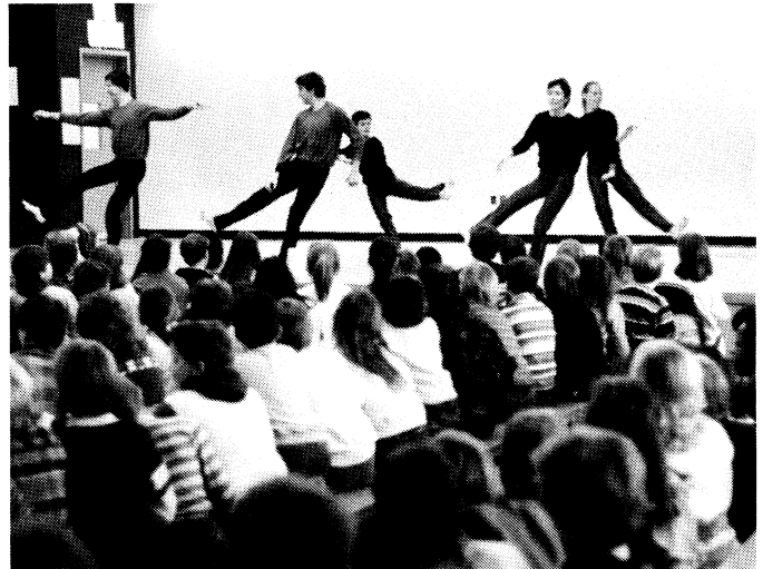
Pupils at the Woodland Elementary School in Milford learn about the world of dance and music in a Data General-sponsored program by the Concert Dance Company of Boston.

During the 40-minute program, titled "All Feet Can Dance," the children had the opportunity to explore all forms of music and dance from modern to classical, soft shoe to jazz. As part of the program, pupils were invited to join the dance group on stage and experience firsthand the strength and coordination required in the various dances. A question-and-answer session, where children learned what it takes to become a professional dancer, concluded the event.