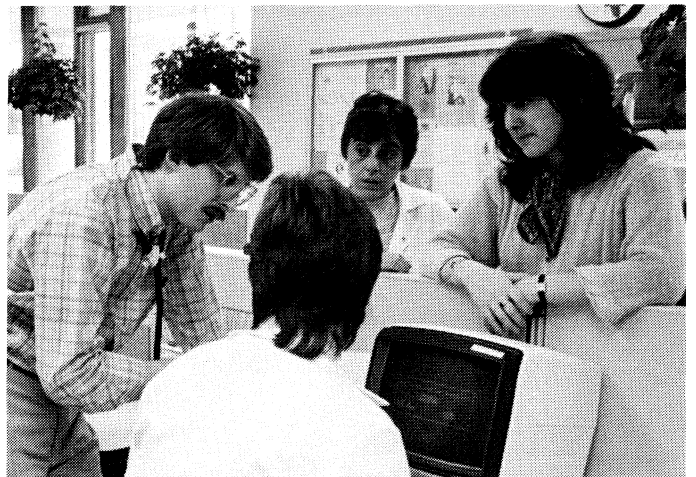
A doctor at the Framingham Union Hospital reviews a patient's medical records via a Data General DASHER D210 terminal.

The Data General equipment is the first step in project to fully automate the operation of the hospital from patient admission to release which is expected to be completed by 1986.